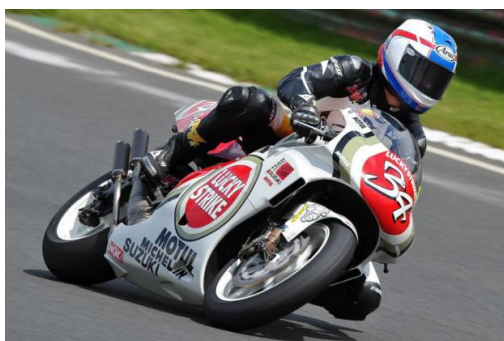
Kevin Schwantz at 2012 Festival of 1000 Bikes

The VMCC Festival of 1000 Bikes is supported by some of the biggest names in the old bike movement including Footman James Insurance Brokers, Bonhams Auctioneers, Mortons Motorcycle Media, the National Motorcycle Museum, Norton Motorcycles, Michelin Tyre PLC, Ducati UK as well as corporate partner Eriks UK.