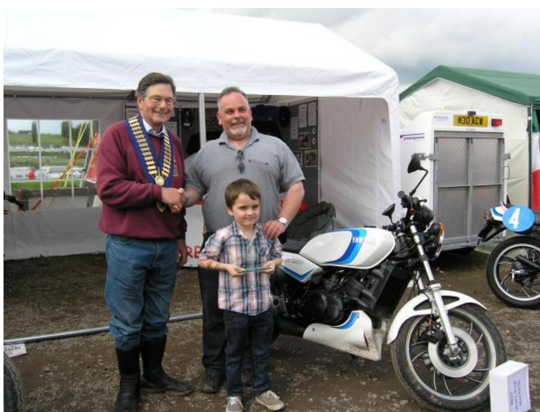
The Classic Racer Magazine best club stand went to the Yamaha LC Club.