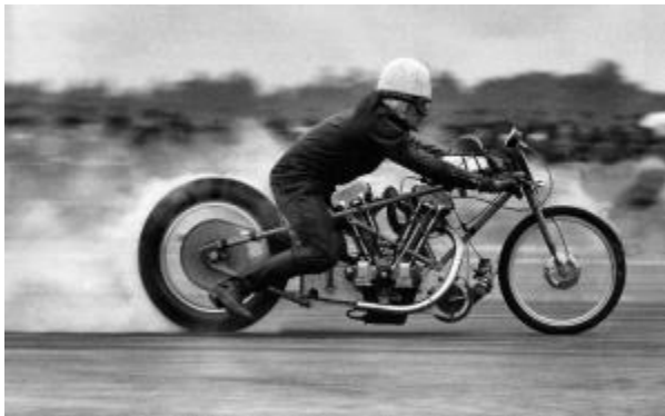
PAST MASTERS PARADE

Riders in the sprint demo are mounted on a cross section of machines from the Vintage era, through to Modern Rocket Ships. Few remain as the maker intended, having been either much modified or tuned (usually both!) They have been selected to represent a typical Sprint Meeting that could have taken place on any Sunday during the last 60 years and to give an idea of the sort of machines that form the backbone of Sprinting.