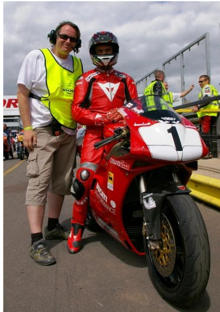
VMCC CEO with "Foggy" before his parade session

the old bike movement including Footman James Insurance Brokers, Bonhams Auctioneers, Mortons Motorcycle Media, The Ace Cafe, the National Motorcycle Museum & corporate partner Eriks UK.